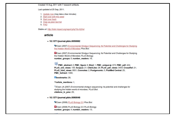
Figure 2. total-impact results page.

September 25, 2011, the data sources used by each are listed in Table 1.